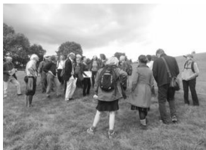
On Barrow Hill, Ashleworth

deserving of this honour not only for the greatness of his poetry, but also because he had served and been wounded for his country.