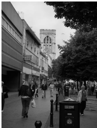
Eastgate Street, Gloucester