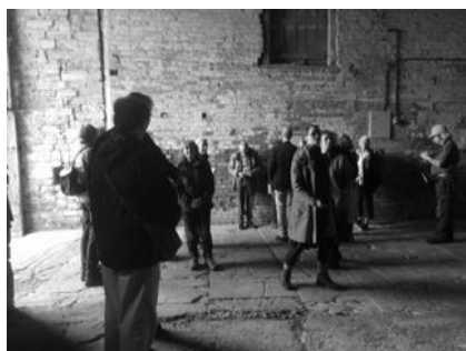
The Tithe Barn at Ashleworth