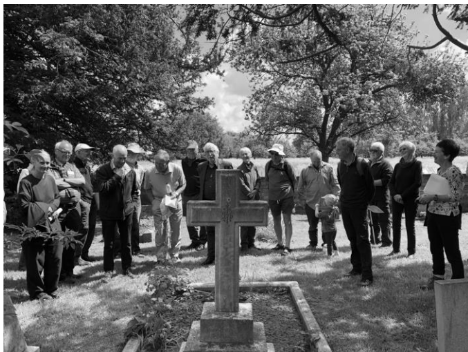
F W Harvey's grave, IG Society walk, Minsterworth, May 2018