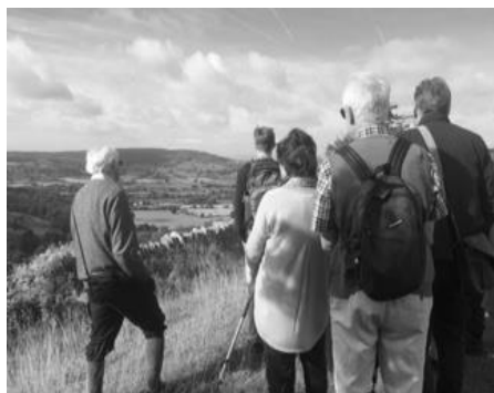
Coopers Hill from Crickley summit